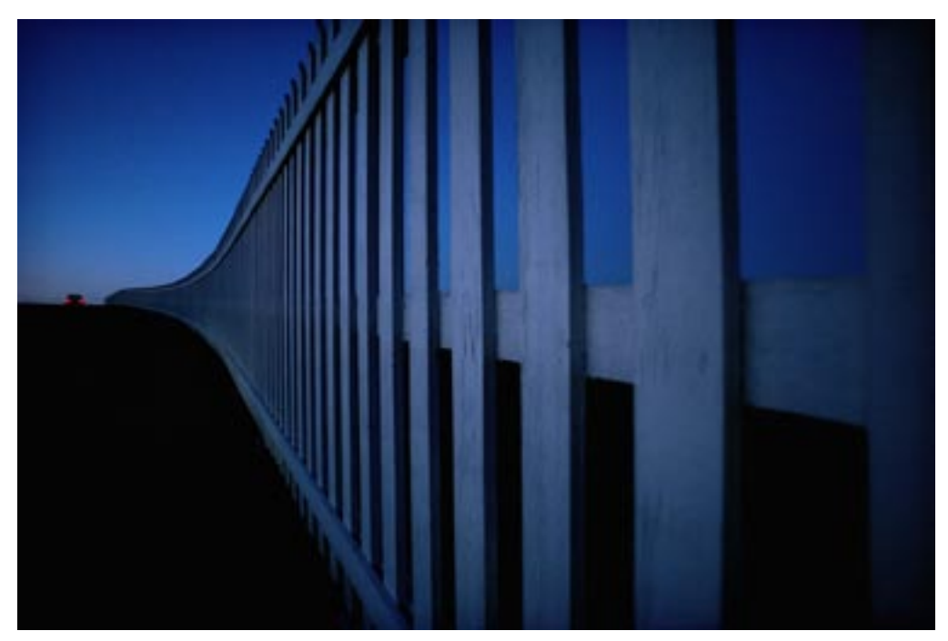
ROAD SONG, 1967.