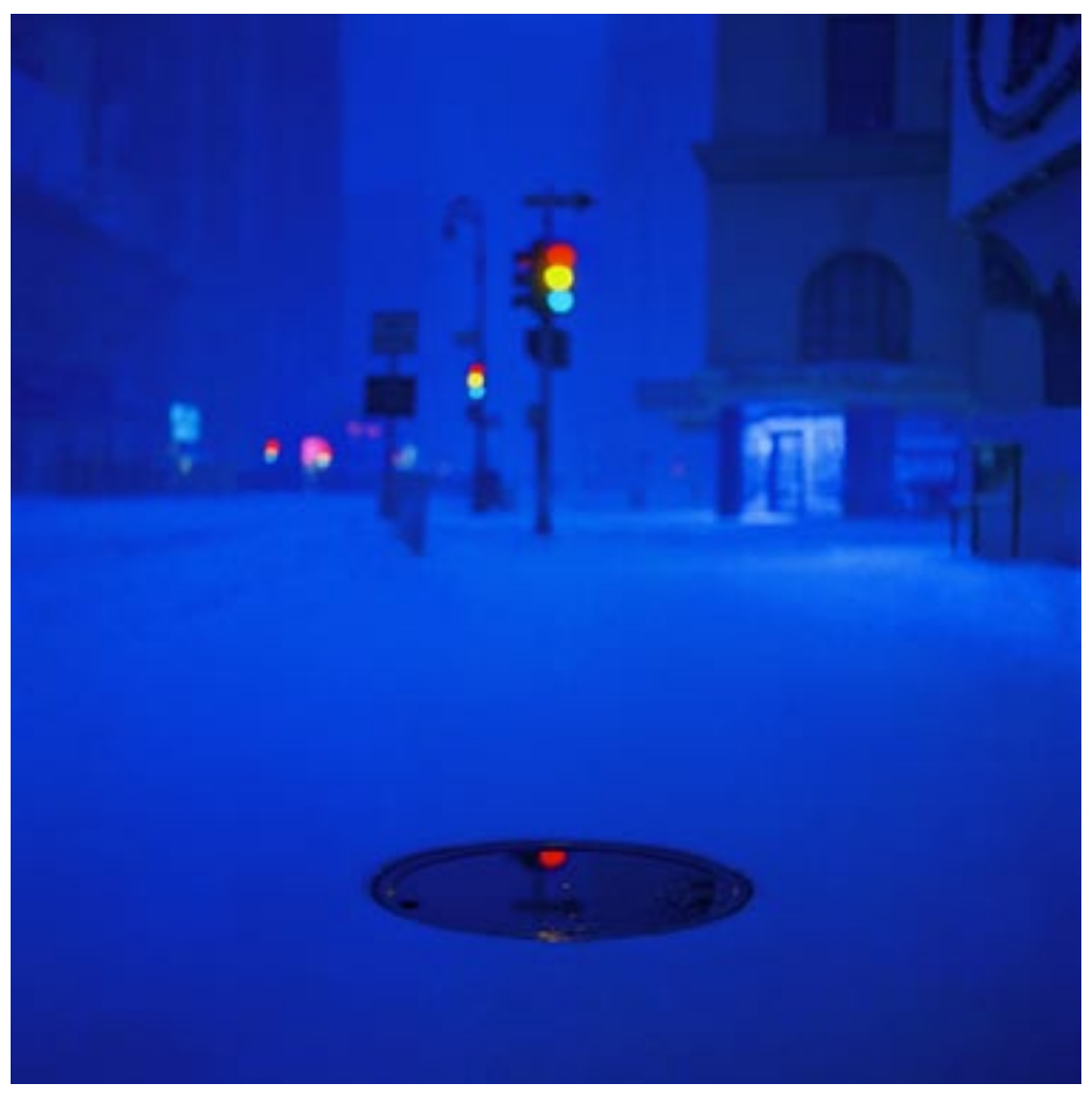
TIMES SQUARE, 1957.