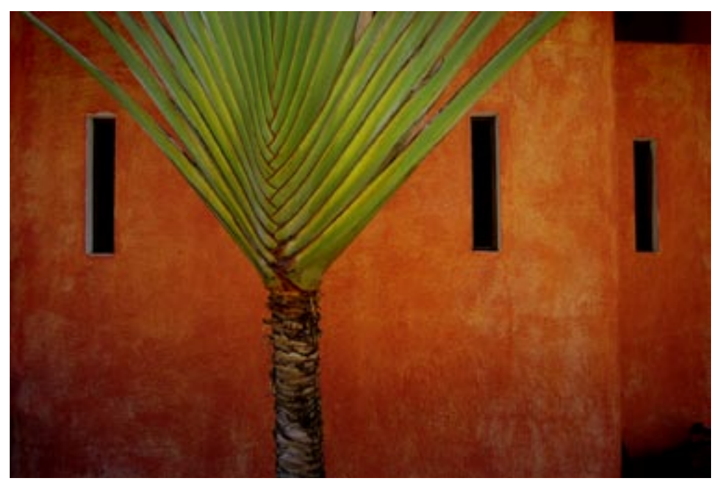
PALM FROND AND WINDOWS, 2004.