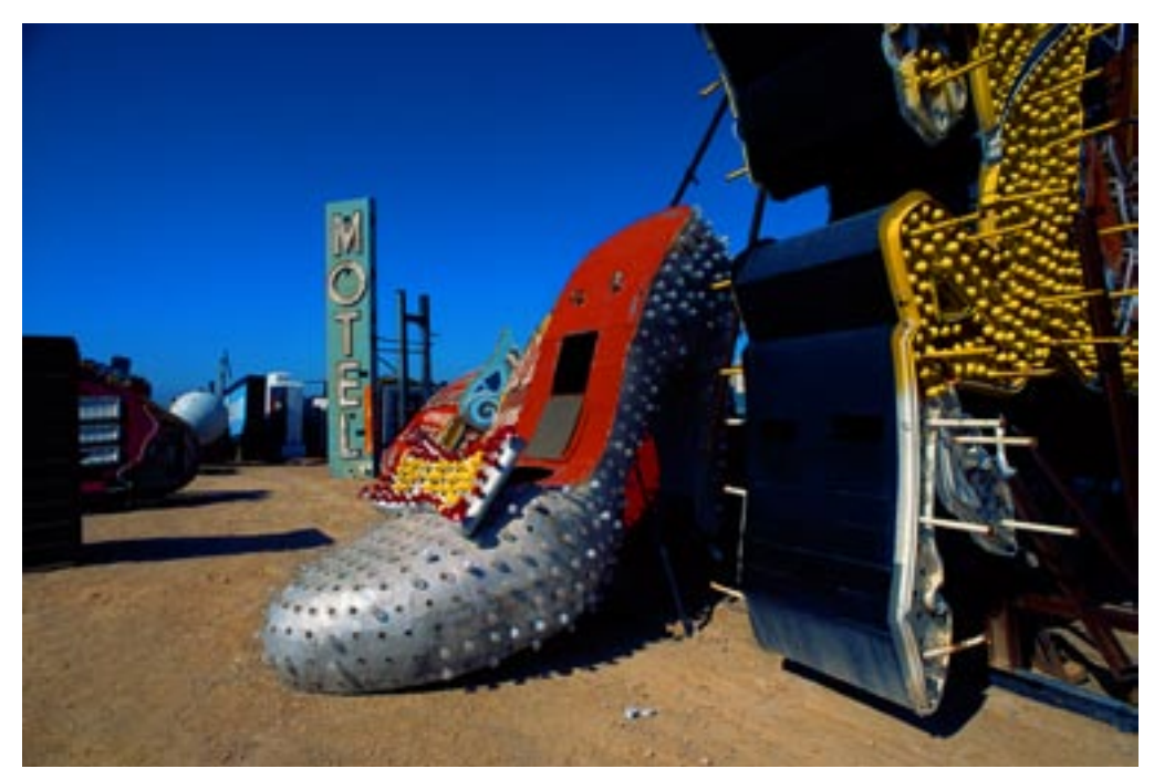
LAS VEGAS SHOE, 1995.